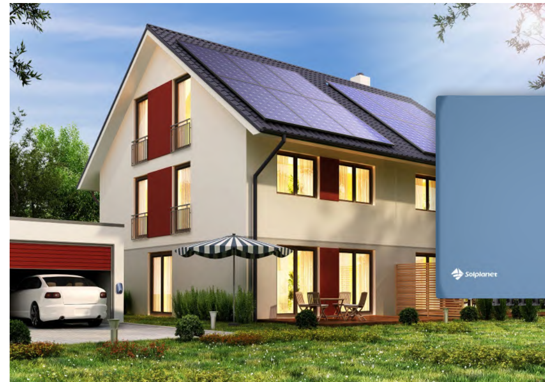
ASW 25-40 LT-G3